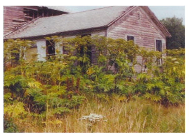
Giant Hogweed in late summer: Seeds are forming.