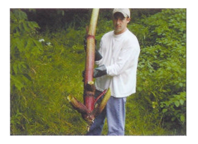
A Herculean stem!